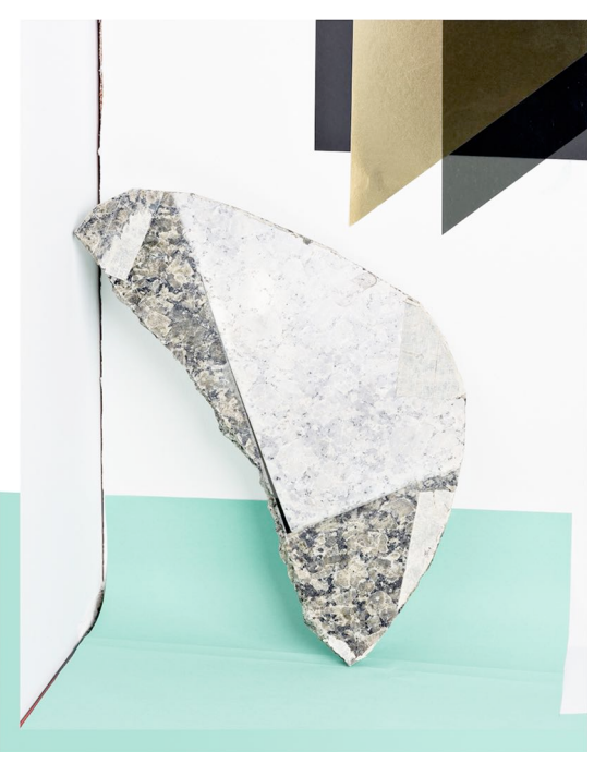
Phillip Maisel, Jeanne and Claude (3943), 2016, Cut archival pigment print and neutral density filter, Variation of 3, 28 \times 22 inches